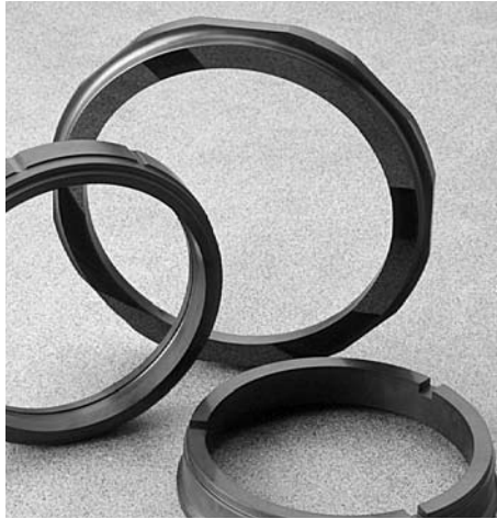
Noralide® NBD-200 Hot Pressed Silicon Nitride

Saint-Gobain Ceramics Structural Ceramics Hexoloy® Products 23 Acheson Drive Niagara Falls, NY 14303 Tel: 716-278-6233 Fax: 716-278-2373 e-mail: scd.sales@saint-gobain.com www.carbo.com